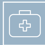
SilSo MEDICAL Medical Applications