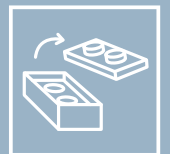
SilSo MOULDING Mould Making & Rapid Prototyping