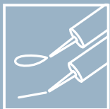
SilSo ADHESIVES Industrial Adhesives