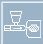
SilSo INJECTION MOULDING Liquid Silicone Rubber