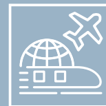
SilSo TRANSPORTATION Mobility & Transportation